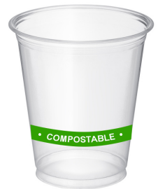
PLA cold cup